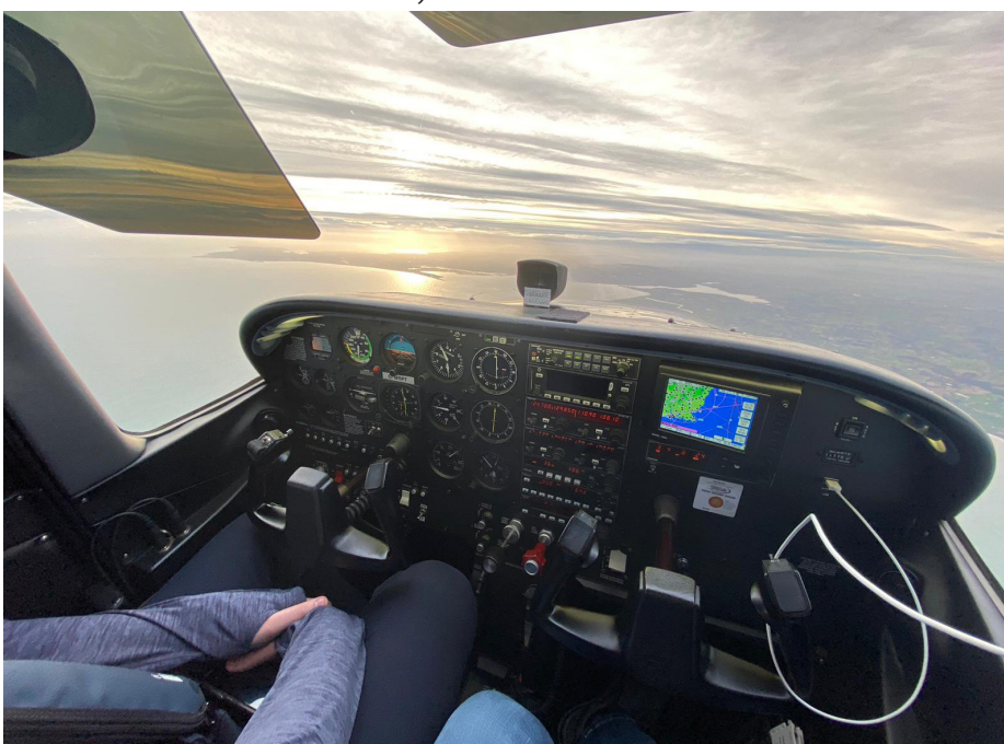
Crossing the Irish Sea on board G-MRPT, with Wexford town and the estuary of the River Slaney in the horizon.