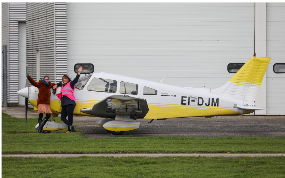
A friendly wave from the two ferry pilots at Lelystad Airport (LEY/EHLE)

Over the next 15 years EI-DJM served the club extremely